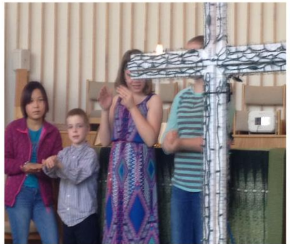
Youth Sunday 2016