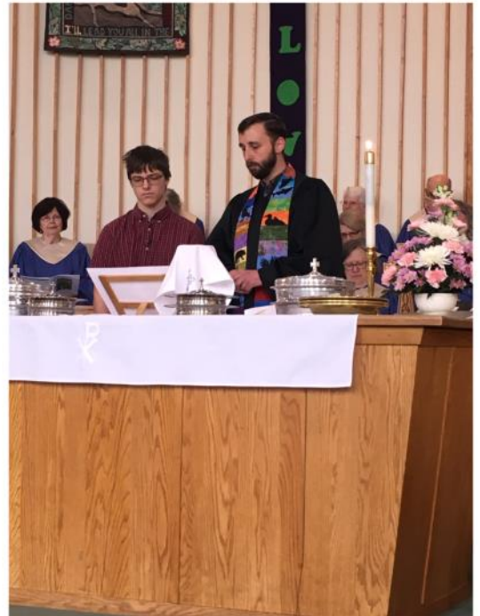
Youth Sunday 2019