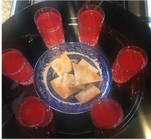
COVID Communion from home