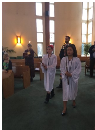
Acolytes bringing in the light to begin the