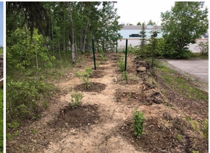
We are beginning the process of converting our grounds to an edible landscape. Four varieties of lingonberries on an unusable steep slope & three varieties of currants where we used to have scrub brush.