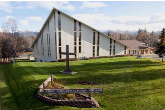
FCC with the Chugach Mountains in the background