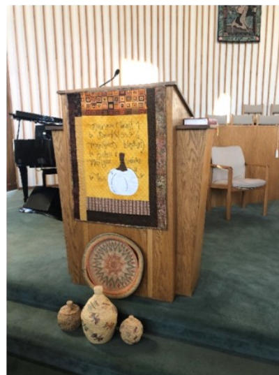
A beautiful autumn parament created by a Church member