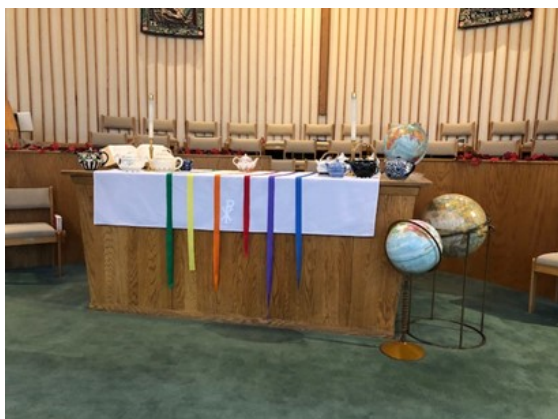
For World Communion Sunday, our elements were tea and sticky rice balls