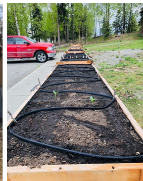
Building raised beds for summer vegetable crops