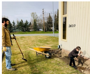
Creating a bed for Jerusalem artichokes