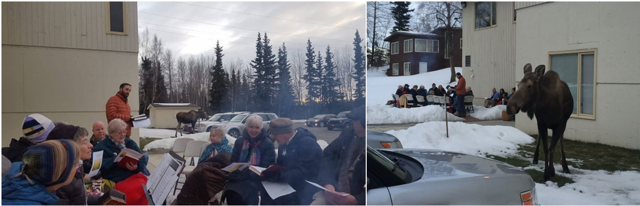
Easter Sunrise Service with our Resurrection Moose Resurrection Moose seemed to enjoy the singing.