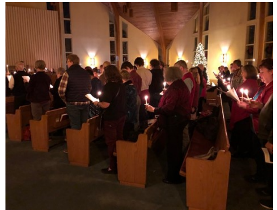
Christmas Eve Candlelight Service