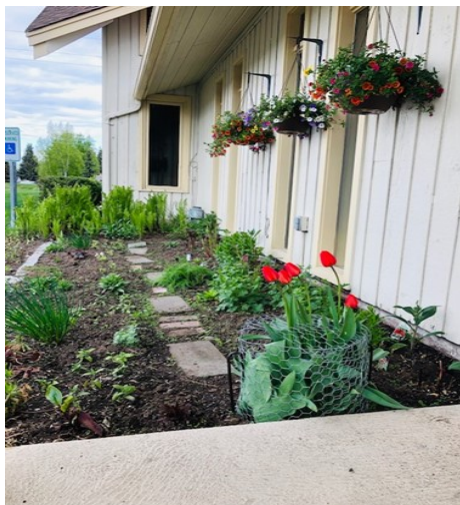
Along with the edible plantings, we keep our front garden filled with flowers and ferns as a warm welcome to the church.