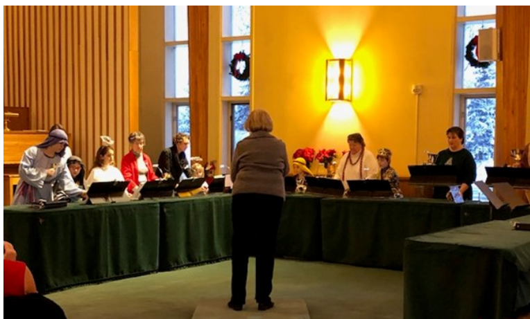
The Intergenerational Handbell Choir