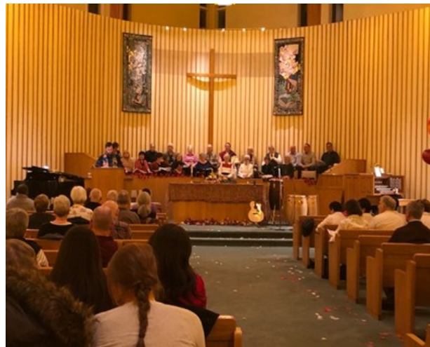
Sunday Worship Service