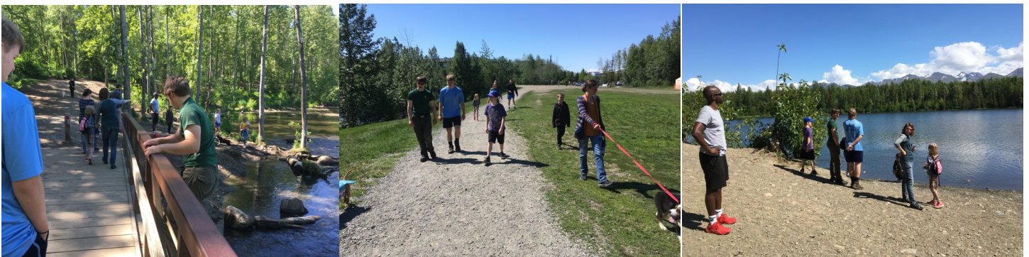
PF Youth at University Lake